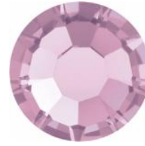
Light Amethyst AM