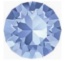
Light Sapphire LS