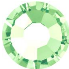
Light Peridot LP