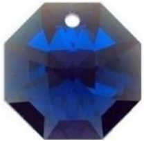
Dark Sapphire DS