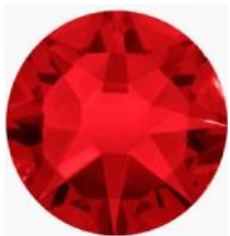
Light Siam LSI