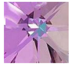
Vitrail Light VL