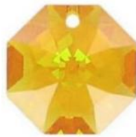
Light Topaz LT