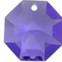
Blue Violet BV