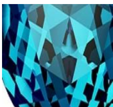
Bermuda Blue BB

“Effects” is an application applied to clear crystal which results in a shimmering appearance usually showing 2 or more colors. The effect will appear on the back side of the crystal but is rather opaque so light does not pass through the crystal but bounces back out the front side resulting in a beautiful, brilliant effect. Effects are used a lot on jewelry but is also used on window Prisms.