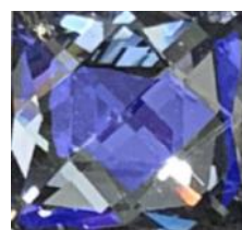
Ultra Shimmering Blue USB