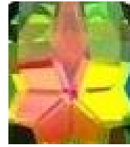
Vitrail Medium VM